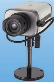
▶ Auto Iris Lens