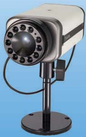
▶ IR Lens